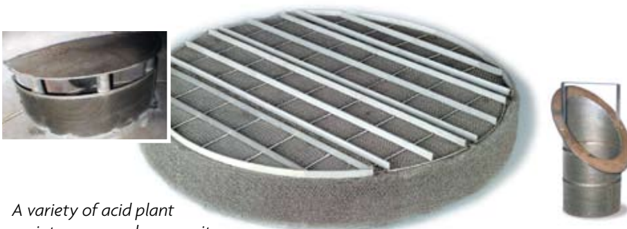
A variety of acid plant maintenance and process items can be fabricated from ZeCor corrosion resistant high performance alloys.