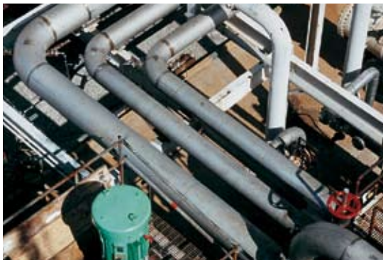
Standard and custom fabricated ZeCor pipe fittings in various sizes are readily available for acid piping systems from MECS.