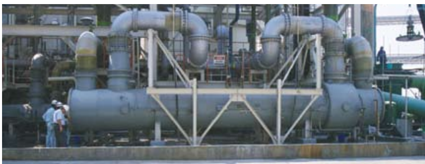
"MECS ZeCor ASME code rated Acid Cooler"