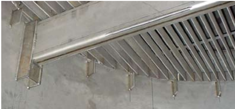
ZeCor packing supports are designed with more than 80% open flow area resulting in excellent gas distribution.